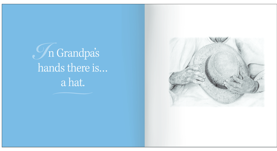
Drawings by Barbara Cervone from In Grandpa's Hands © 6/08